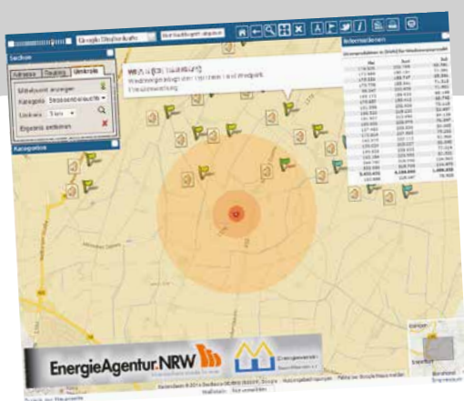
Wind power plants

You may also integrate other Web map services, cadastre data, site plans or your own maps or aerial photographs as well as any kind of additional information - directly from the database, imported via standard list formats. GooGIS can even be linked to a dynamic database, this way showing the most current data in the map. It also facilitates GPS online tracking to locate and identify vehicles. Implement the current weather or traffic situation by using webcams, Wikipedia entries or Panoramio photos. There is no limitation for individual applications. GooGIS is wide open for your ideas and requirements.